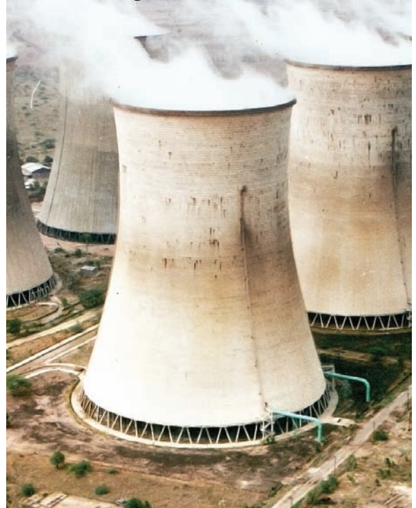
Raichur Cooling Towers 1995