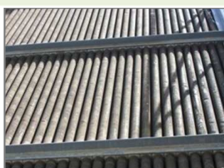
Fin Tube Bundles for ACC (10 MW)