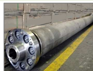
Drive Shaft 18 ft.