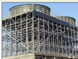
Pultruded FRP CT Structure