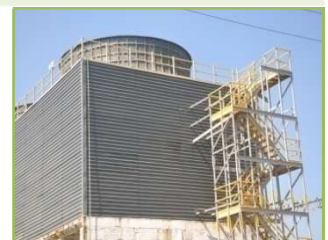
Pultruded FRP CT (1800 m3/hr)