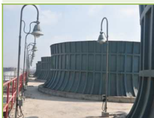
FRP Fan Stack