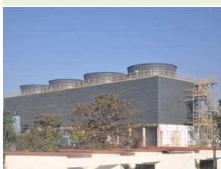
Pultruded FRP CT (1x4500 m3/hr)