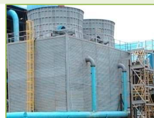
Pultruded FRP CT