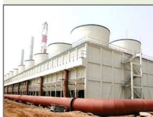
RCC CT (6 x 40000 m3/hr)

Business Group 'S' & 'W' offers RCC Cooling Towers with film or splash fill, Cooling System including Pumping Station and Chemical Dosing System on EPCC/ Lump sum Turnkey basis excluding RCC construction. GTPL utilizes proprietary design and development software to other single point cooling solutions. Major applications include heavy industries like Power, Petrochemicals and Refineries, Steel Sector, Chemical industries and Sugar Industries.