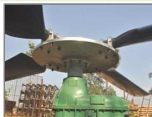
Fan Assembly 10 m. Dia.