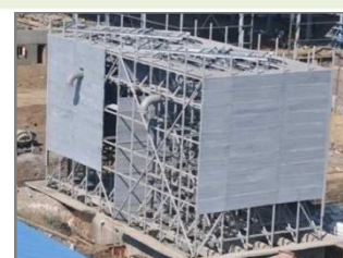
Pultruded FRP CT (1800 m3/hr)